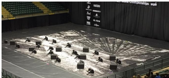
Green Hope - SA