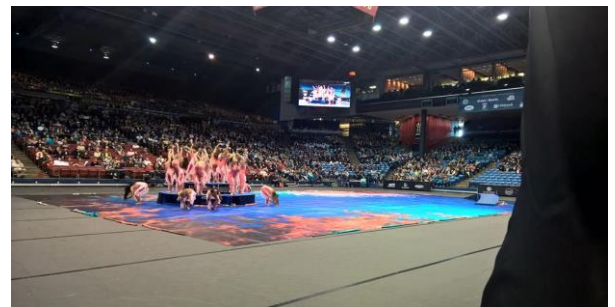
Cleveland HS – SO