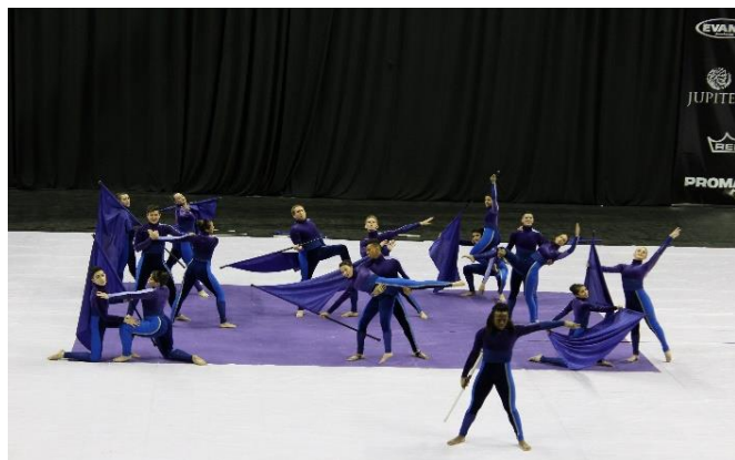
Stonewall - IO