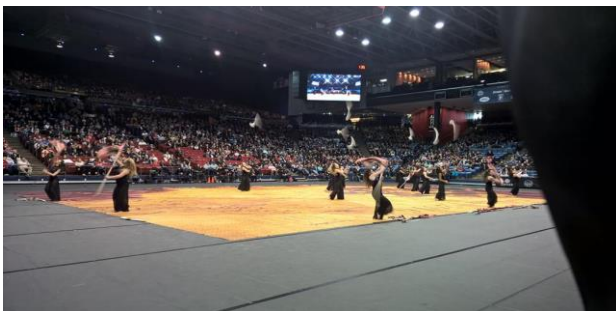
Cape Fear HS – SO