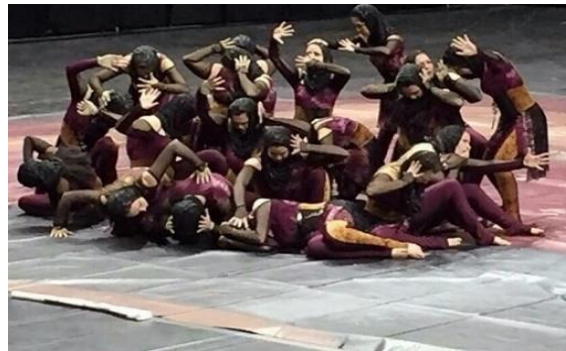
JMU – Nuance - IA