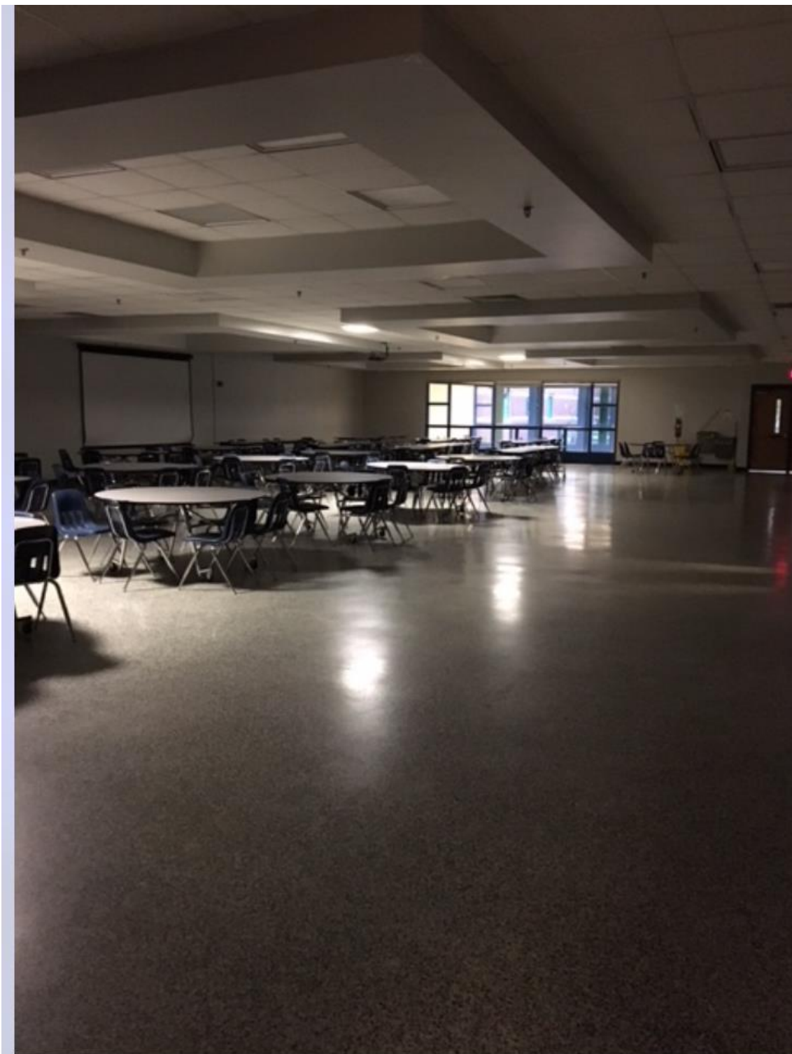
Body Warm Up