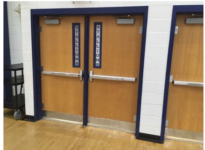
Color Guard Entry Door